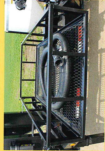
Mini Bulk Platform • 2 Tote Capacity • Hinged Gates on Each Side