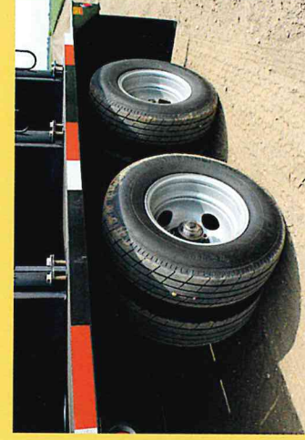
Tandem Axle Running Gear • Spring Suspension, Electric Brakes, ST235/80R16 Radial Tires