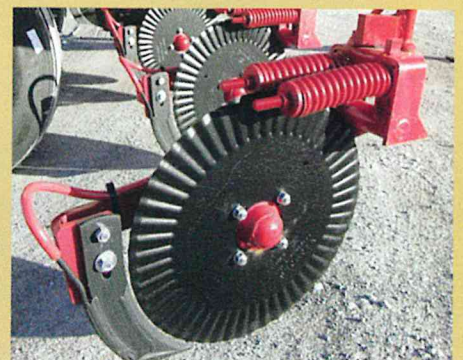
KBH double spring coupler and knife assemblies