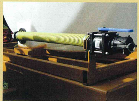
Ground fill attachment-2" full port (Gooseneck model shown)